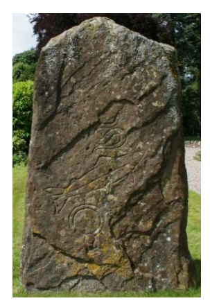
Fig. 4 Glamis Class I symbol stone.

Class I: These are erratic boulders or roughly prepared slabs of stone, decorated with groups of incised or pecked symbols, such as animals and various objects, but no crosses (fig. 4). They are seen as the earliest stones, dating from up to the late seventh century.