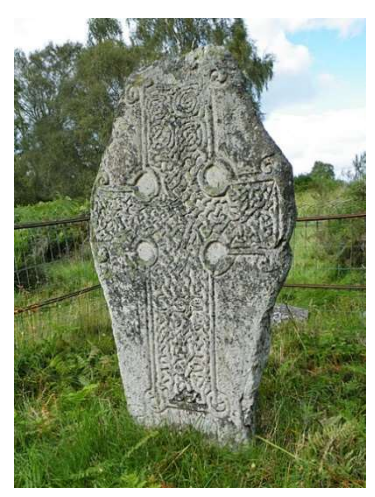
Fig. 6 Kinord Class III symbol stone.

Class III: This is a more disparate group, which is given a rather late date, overlapping in time with Class II. Class III stones are carefully shaped pieces where elaborate crosses are the main features (fig. 6). Some of them also have figural embossed scenes. Date: the late eighth and the ninth centuries.