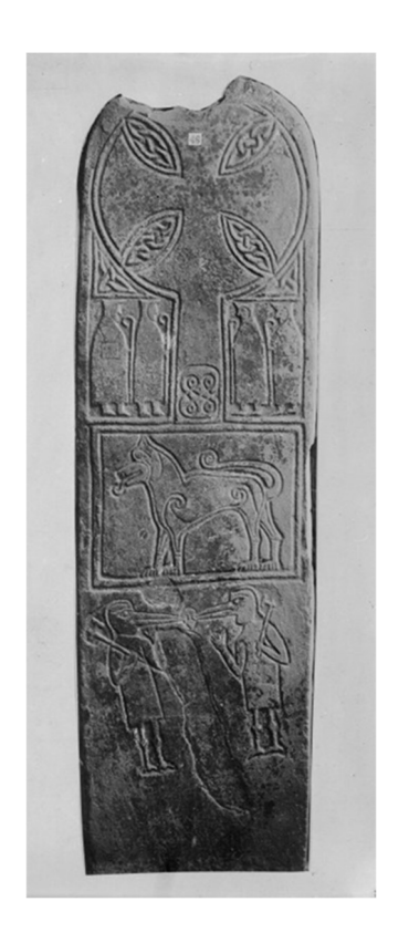
Fig. 14. The Papil Stone, Burray Shetland. This stone was found in the churchyard of Papil Kirk, where it had been reused as a grave cover.