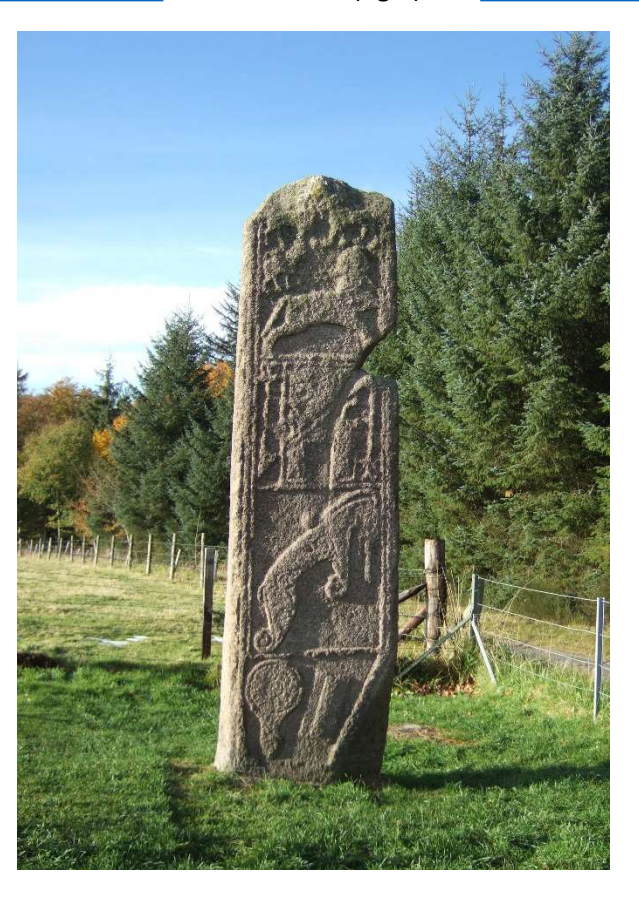
Fig. 1 Maiden Stone.

centre. Numerous individual standing stones can be found in situ across the east and north of Scotland, including the <u>Maiden Stone</u>, Aberdeenshire (fig.1) and <u>Sueno's Stone</u>, Moray.