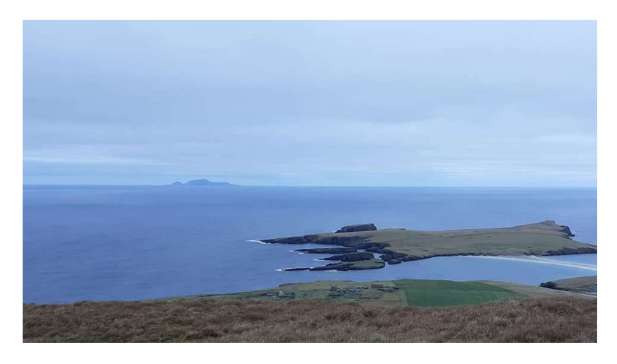
Fig. 9. View over St Ninian's Isle from the Shetland Mainland.

Another religious site of interest is Dunkeld Cathedral (Fig. 10), which was preceded by a Pictish monastery. The early Pictish church is now gone, but the many carved stones demonstrate its existence. These include the 'Apostles Stone', dating to the 800s. A few hundred meters north of the church is hillfort, found on the summit of King's Seat, a key geographical feature in the landscape, located on a bend on the in the River Tay. The fort's defences consist of a central citadel occupying the summit of the hill and a series of ramparts enclosing lower terraces. These sites could work well together as part of a heritage trail.