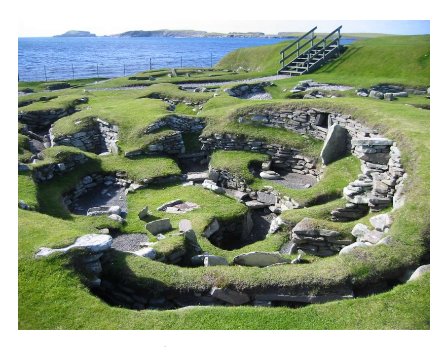
Fig. 2 Jarlshof.

The National Museum of Scotland (NMS) in Edinburgh has a section of the Early People gallery which focuses on the Pictish period in Scotland. The displays incorporate a wide range of artefacts from across Scotland, including highlights such as the Norrie's Law hoard, a major collection of Pictish silver discovered in Fife in the 19<sup>th</sup> century, and the St Ninian's Isle treasure, discovered during excavations on the island in 1958. Near to the entrance to the gallery stands the main portion of the Hilton of Cadboll Stone, a late-8<sup>th</sup> / early-9<sup>th</sup> century Pictish stone originally located at Hilton of Cadboll in Easter Ross.