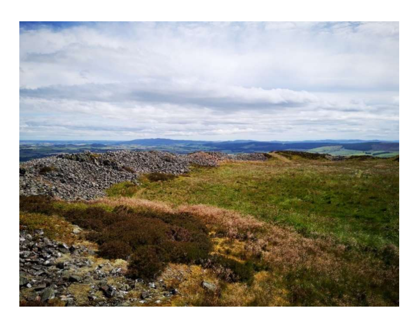
Fig. 12. View from inside the Iron Age/Pictish fort at the top of Tap o'Noth.

Tap o'Noth is a particularly interesting site, as it was only recent excavations that clearly showed that this site was extensively used by the Picts. Indeed, this site was linked to several other Pictish high status/royal sites in the immediate vicinity, such as Rhynie where an elite settlement has been excavated. In the area, there are also a number of Pictish stones that are easily accessible.