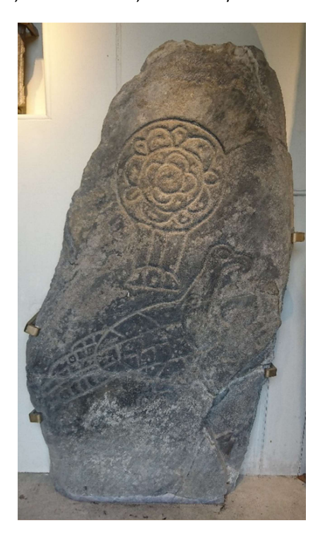
Fig. 8. One of the Class I stones at Inveravon Church, Banffshire.