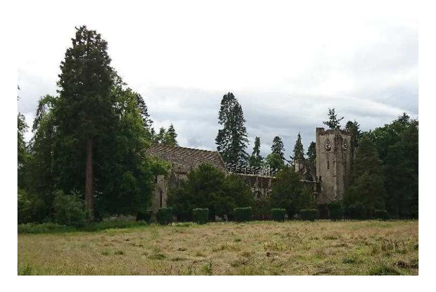
Fig. 10. Dunkeld Cathedral.

Another religious site of interest is Dunkeld Cathedral (Fig. 10), which was preceded by a Pictish monastery. The early Pictish church is now gone, but the many carved stones demonstrate its existence. These include the 'Apostles Stone', dating to the 800s. A few hundred meters north of the church is hillfort, found on the summit of King's Seat, a key geographical feature in the landscape, located on a bend on the in the River Tay. The fort's defences consist of a central citadel occupying the summit of the hill and a series of ramparts enclosing lower terraces. These sites could work well together as part of a heritage trail.