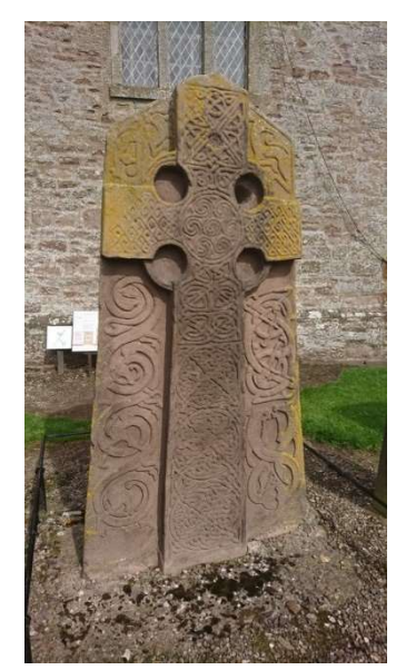
Fig. 5 Aberlemno cross-slab.

Class II: These stones are seen to represent the next chronological phase, the coming of Christianity. Class II stones are more carefully finished slabs onto which symbols and a cross have been carved on one or both sides (fig. 5). Usually, the cross is on one side and the symbols are on the other.