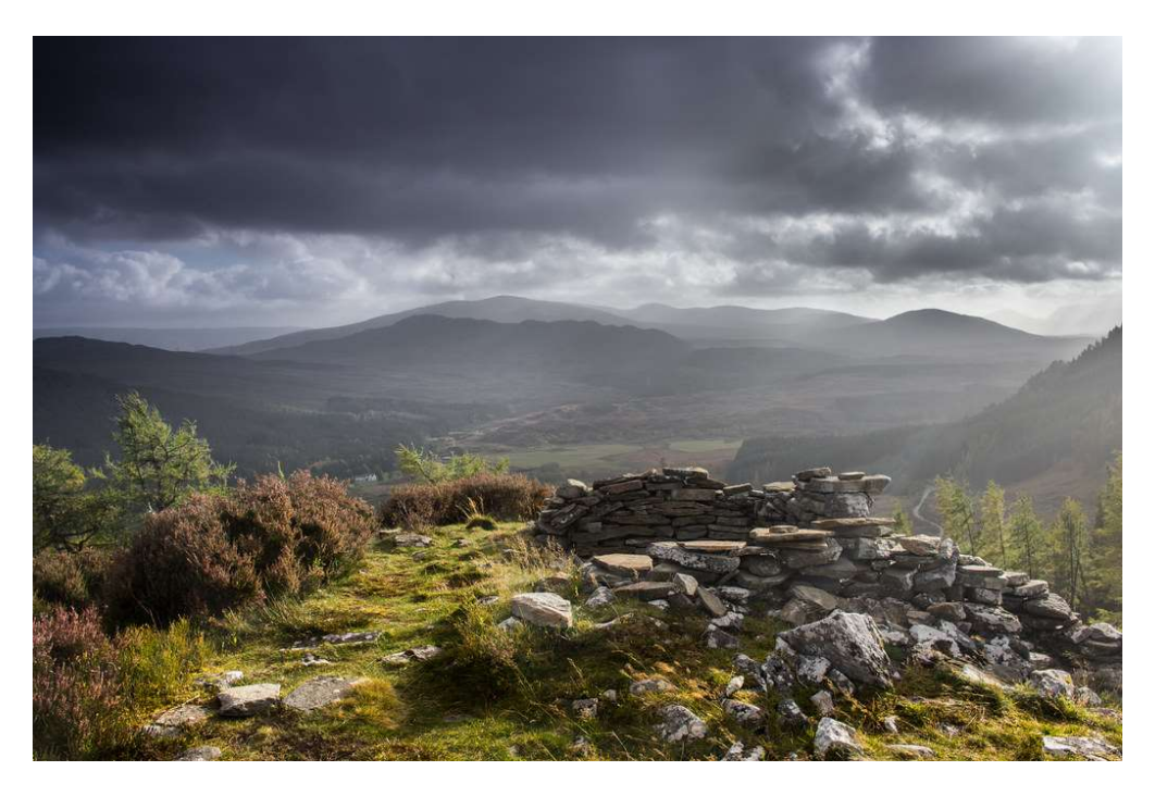
Fig. 3 Dun da Lamh hillfort.

The National Museum of Scotland (NMS) in Edinburgh has a section of the Early People gallery which focuses on the Pictish period in Scotland. The displays incorporate a wide range of artefacts from across Scotland, including highlights such as the Norrie's Law hoard, a major collection of Pictish silver discovered in Fife in the 19<sup>th</sup> century, and the St Ninian's Isle treasure, discovered during excavations on the island in 1958. Near to the entrance to the gallery stands the main portion of the Hilton of Cadboll Stone, a late-8<sup>th</sup> / early-9<sup>th</sup> century Pictish stone originally located at Hilton of Cadboll in Easter Ross.