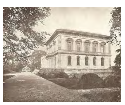
Queen Margaret College (opened 1884)