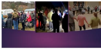
PARTNERSHIP WITH DUNDREGGAN REWILDING CENTRE (TREES FOR LIFE)