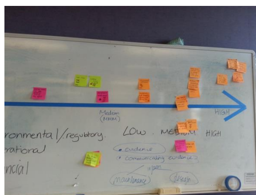
Figure 2: Scoring biofouling concerns with regards to operational, financial, and environmental risk (left), and prioritising issues as a whole group (right).