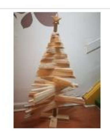
Wooden Christmas Tree