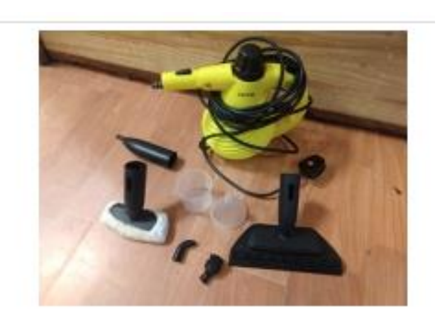
Lervia Steam Cleaner