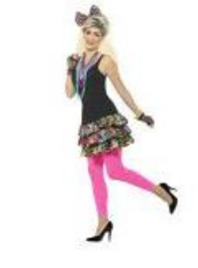
80's party costume